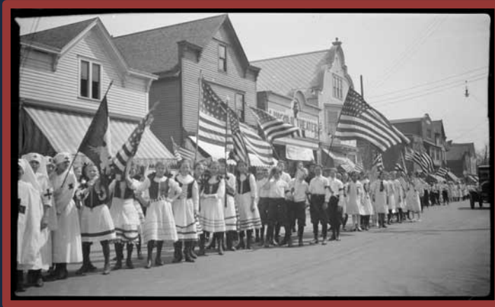
Photo history focuses on ethnic settlements

Urban Anthropology Inc. has created this historic publication on the Milwaukee area originally settled by the Poles. The book is part of Arcadia Press' Images of America series. Including nearly 200 photographs, the volume tells the story of the various ethnic migrations to the area, which resulted in a community of 110 nations today.